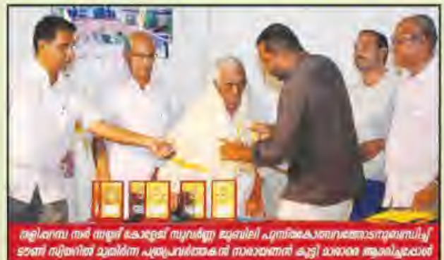
തൃശ്ശൂർ നഗർ സമൂഹ കമ്മ്യൂണിക്കേഷൻ കമ്മിറ്റി പ്രസിഡന്റ്മാർക്ക് സമ്മാനപത്രം സമർപ്പിക്കുന്ന ചടങ്ങ്